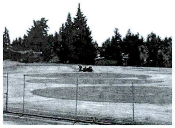
The soccer field was seeded this spring and will be opened for use next summer.

The City also completed ball field renovations in partnership with the School District and South Highline American and National Little Leagues.