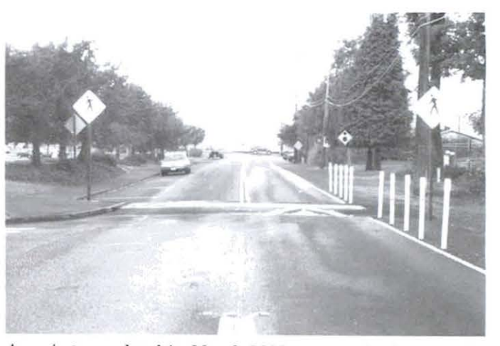
A project completed in March 2000 was a raised crosswalk with signage improvements at the intersection of Redondo Way South and 4th Place South.

If you would like more information on the City's Neighborhood Traffic Control Program, please contact the City of Des Moines Public Works and Engineering Department at (206) 870-6522.